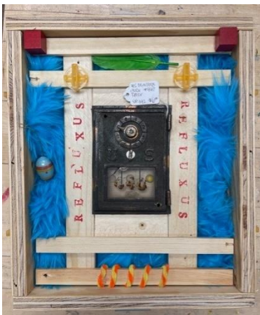
Refluxus Box #1 or Art Can Be Fun and Easy Erik Ritter Mixed Media with interactive elements $1000