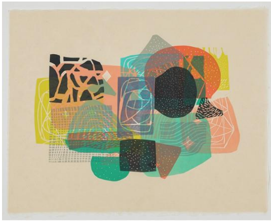
Rewind / F L O A T