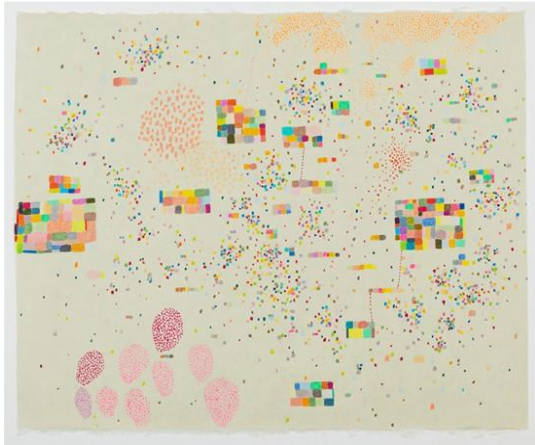
In the Present