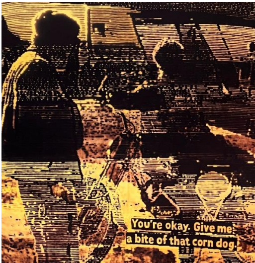
Le Rencontre Corn Dog (After Courbet)